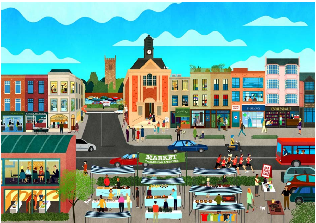
Illustration by Dermott Flynn